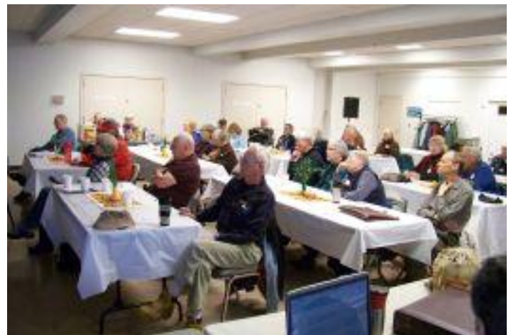
An enthusiastic audience asked many questions of the Microsoft Representative.

Getting a new computer For Christmas? Consider donating your Old one to KCS's New Horizons.